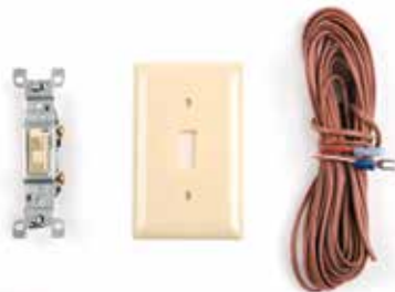
GWMS2 On/Off Wall Switch Kit