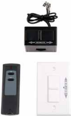
RCKIT 4001 On/Off Remote Receiver Wall Plate Kit