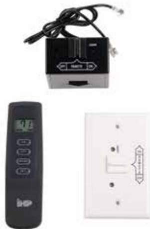
TRC T'stat On/Off Remote Kit