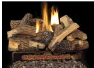
Tri-Flame Series . . . . . 10-11