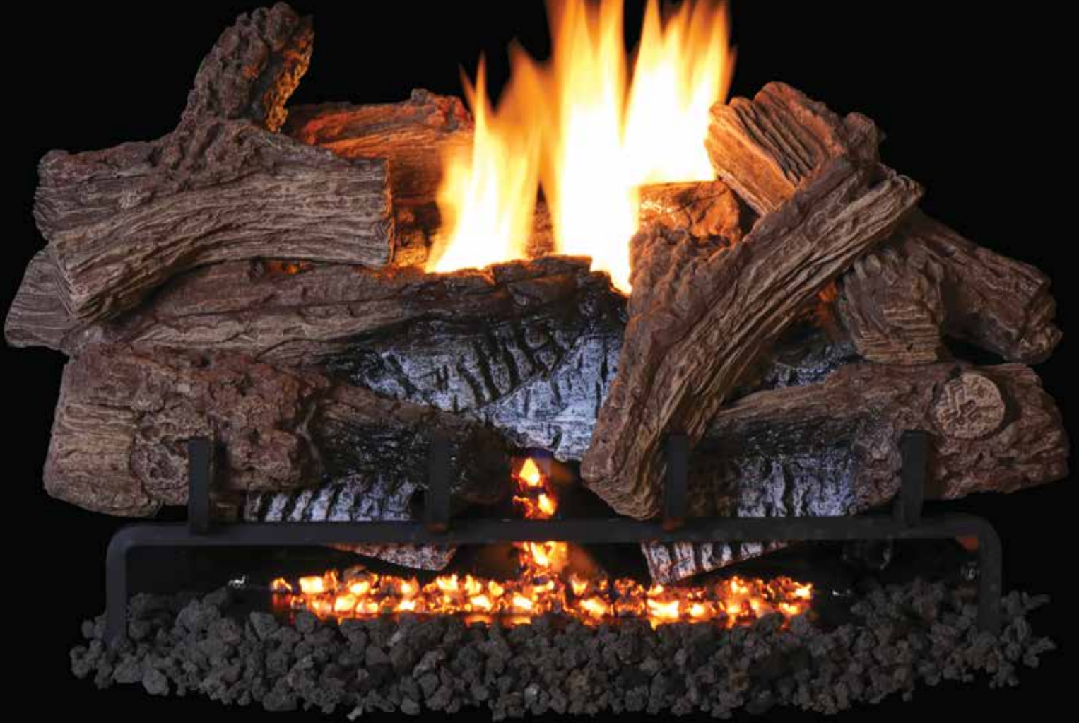
WESTERN TIMBER Logs with TRI-FLAME Burner System