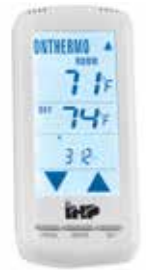
EcoFlow Remote (Included with Electronic Control Model)