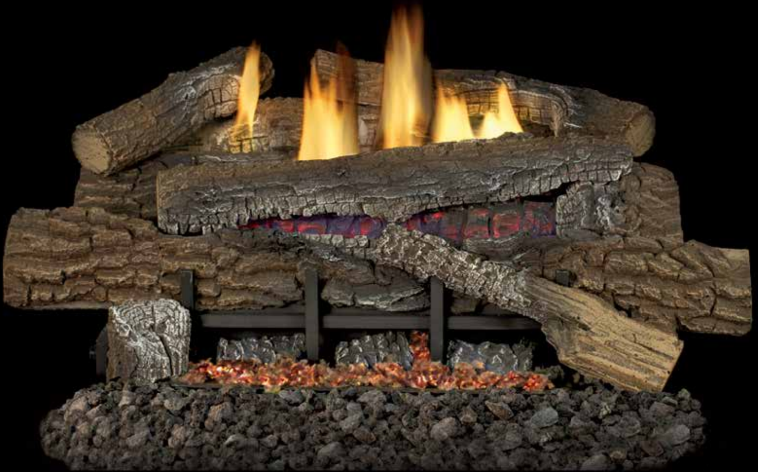
BISON MOUNTAIN Logs with BLAZE N' GLOW Burner System