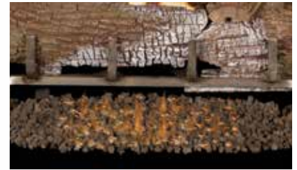
MFEB Volcanic stone Ember Bed (Optional)