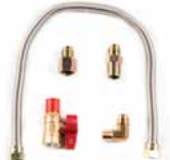
CIKA Gas Appliance Installation Kit