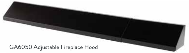
GA6050 Adjustable Fireplace Hood