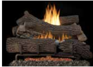
Magni-Flame Series . . . . . 6-7