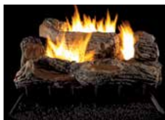
Multi-Sided Series . . . . . 14