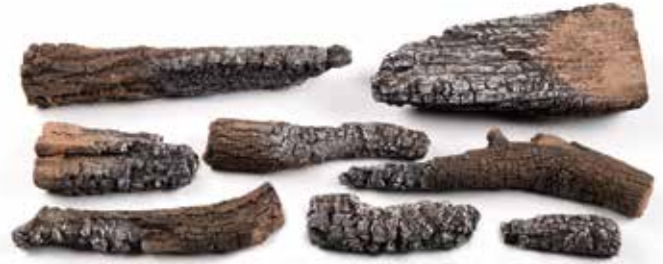
LAMF-Decorative Log Accessory Kit (Giant Timbers)