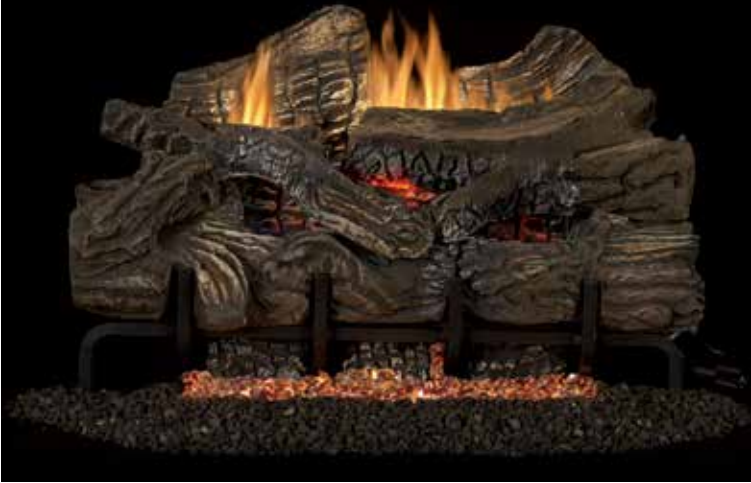
Ceramic Fiber Logs