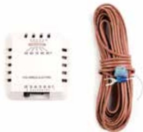
GWMT1 Wall Mount T'stat Control Kit