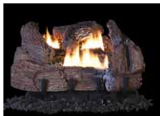
Dual-Flame Series . . . . . 12-13