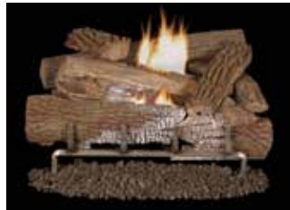
Magni-Flame Outdoor . . . . . 8-9