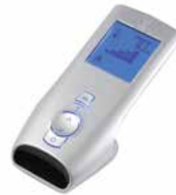
ProFlame Remote (Included with Variable Control Model)

The Magni-Flame Series boasts a triple burner to achieve the look of a real wood fire! The burner is cantilevered to produce tall flames that will not be dwarfed by its massive 19" high logs, the tallest in the industry. Magni-Flame models feature two burners of bright yellow flames, plus a lower burner that creates a glowing ember bed. All models are heater rated with 99% heat efficiency and include a wood-burning grate appearance.