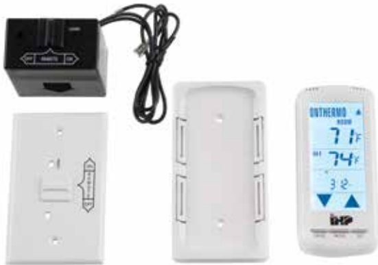
TSRC Receiver Touch Screen Remote Kit