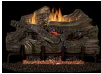
Blaze N' Glow Series . . . . . 4-5