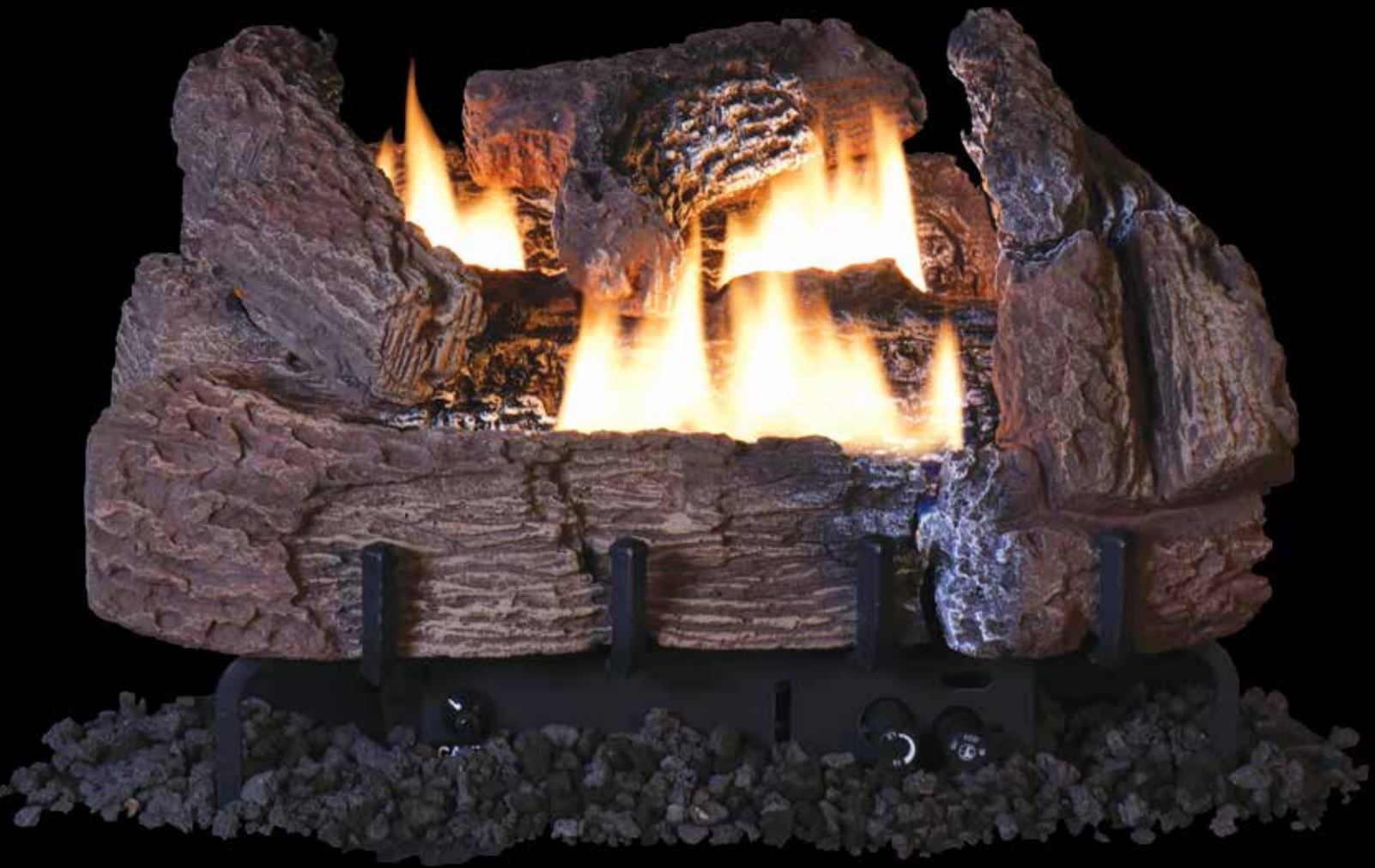
CAROLINA OAK Logs with DUAL-FLAME Burner System