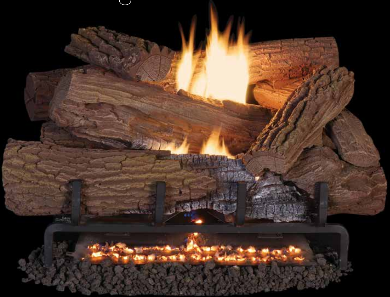
SHADY HOLLOW Logs with MAGNI-FLAME Burner System