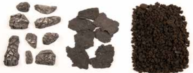
FM100 Floor Media Kit (3 media types) or Separate FDVS Volcanic Stone