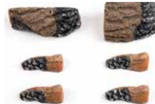
CDABKA Decorative Ash Bed/Control Cover Kit