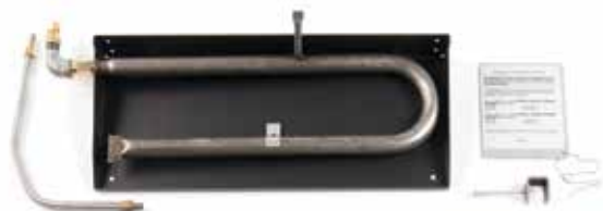
MFEB Volcanic Stone Flame Bed Kit (Mega-Flame Outdoor Series Only)